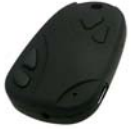
1- Mini KC-DVR